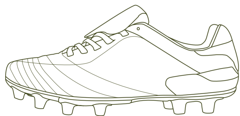
Moulded studded football boots

Appropriate footwear must be used to protect the artificial grass surface